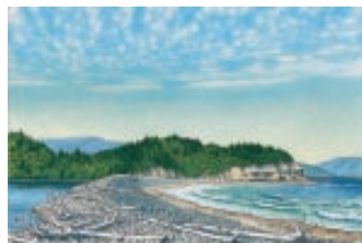
Barrier Beach at Yellow Head, Cape Breton