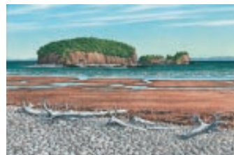
Time & Tide, The Brothers Islands, Bay of Fundy