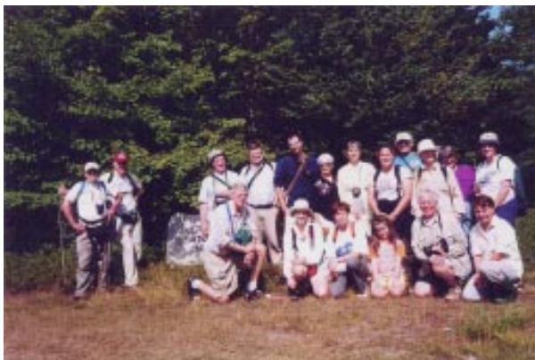
Nature lovers on a guided walk at Gillfillan Lake in 2001

The NS Nature Trust will lead a short walk to Wilson's Lake Nature Reserve. Come out and see the rarest plant species in Canada and learn about their history, significance and ecology! Bring sunscreen, water and snacks. Meet at the carpool parking lot at 9:30, Exit 33, Hwy 103.